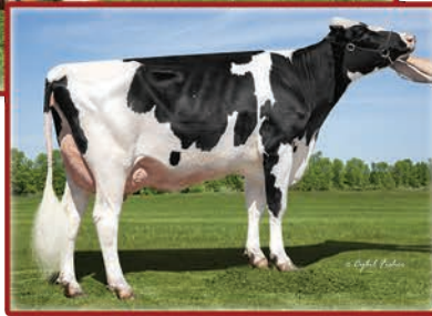
DAM: DEWGOOD 720-816 CASHIER-ET VG-86