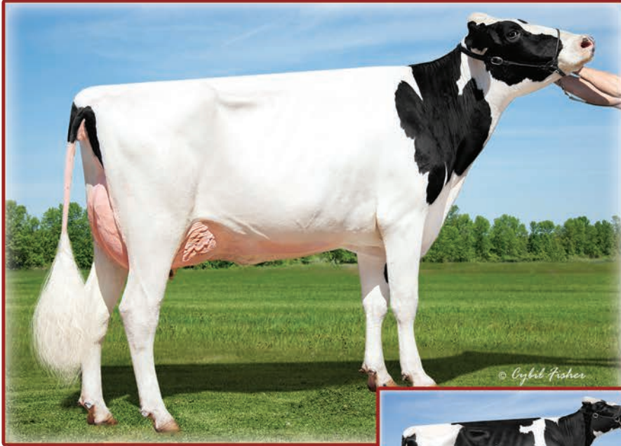
3RD DAM: SPEEK-NJ T JOYFUL-ET VG-85 DOM