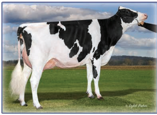
DAM: DUCKETT LAMBDA HIVANNA VG-88 EX-MS

2ND DAM: S-S-I DOC HAVE NOT 8784-ET EX-96 DOM RESERVE ALL-AMERICAN 4 YEAR OLD 2022