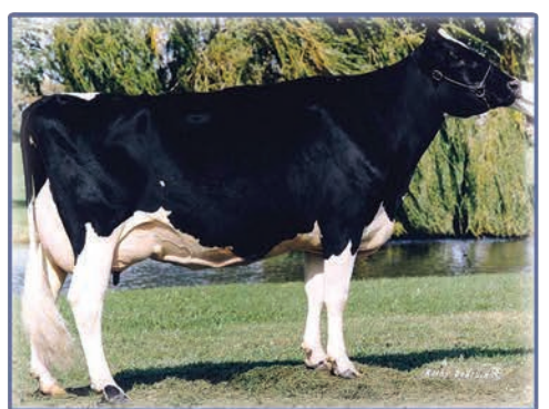
9TH DAM: SNOW-N DENISES DELLIA EX-95 2E GMD DOM

SIRE: SIEMERS PFCT HARDY 35126-ET DAM: ETGEN-WAY CHIEF DANICA EX-94 Sired By: STANTONS CHIEF-ET 3-00 2X 365d 33,200 3.9%F 1,311 3.1%P 1,039 2nd Jr. 3 Year Old Mid-East Summer National & Reserve Intermediate Champion-2022