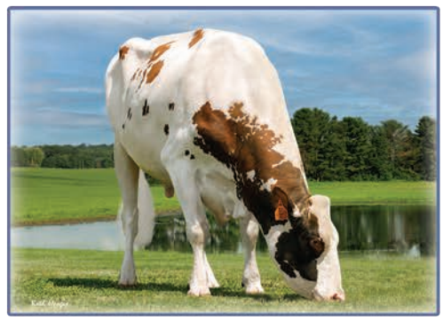
Sire: GOLDEN-OAKS TANGO-RED-ET EX-91