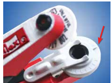
Proper alignment of RFID tag.