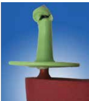
Damaged male stem.