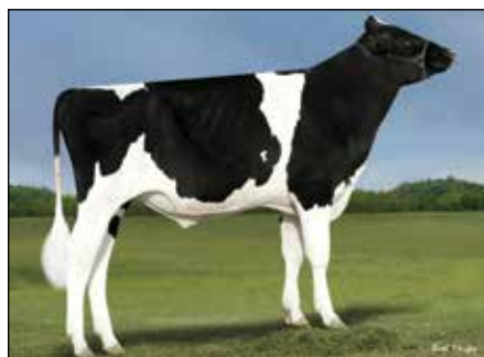
Speek-NJ of Dewgood-ET