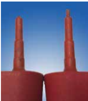
Broken pin on left.

Tag placement on the applicator can also impact retention. Tags not placed on the applicator completely can cause misalignment of the male and female tags during application. Damage can occur to the male stem or the female tamperproof cup, increasing the chances of poor retention. A damaged or missing applicator pin tip will not properly support the tag during application. Damage to the male stem will occur, increasing the risk of male stem failure.