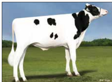
Trent-Way-JS Roddy-ET RC

H olstein Association USA announces a new service to assist Holstein breeders to market semen to other dairy cattle breeders. Holstein Marketplace Sires – a new component of the Holstein Marketplace gives Holstein breeders the ability to directly market semen from their bulls, which will be beneficial to Holstein Association members, and dairy cattle breeders throughout the United States.