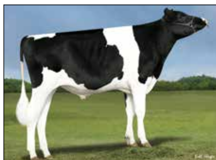
Hurtgenlea Splnd Maurice-ET RC PC