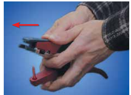
Removing the black clip.

male tag should align with the center of the female tag. If the tags do not align, proper application will not occur, and the tag can be damaged. If needed, replace the applicator pin. The final step before tag application, dip the jaws of the tagger holding the tag into an antiseptic or disinfectant solution to help prevent infection.