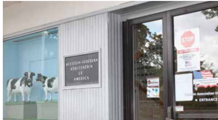
With safety protocols in place, signs remind staff to social distance.